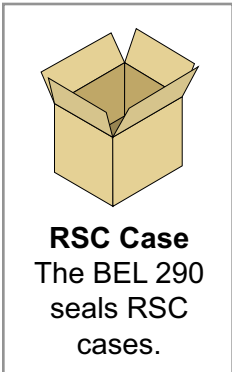
RSC Case The BEL 290 seals RSC cases.