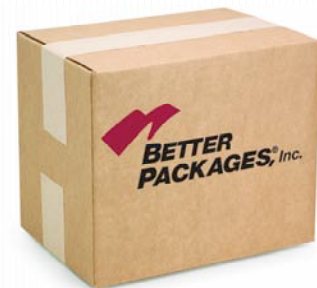
Carton sealed with BetterSeal Secure Tape and the BP 333 Plus